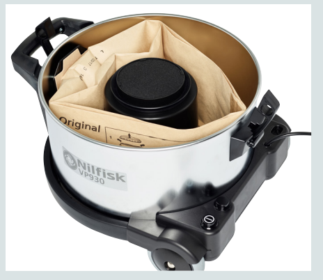
Durable steel container and 15 litre dust bag