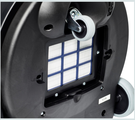
HEPA H13 exhaust filter for top rated filtration level maintaining a high quality of air within the cleaning area

Dual speed function on selected variants