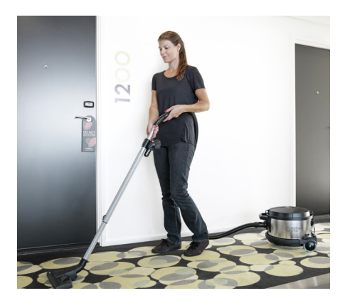
VP930 is specially built for noise sensitive areas with a low comforting background sound pressure level from only 53 dB(A)