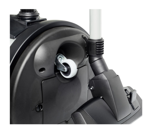
Parking solution as standard