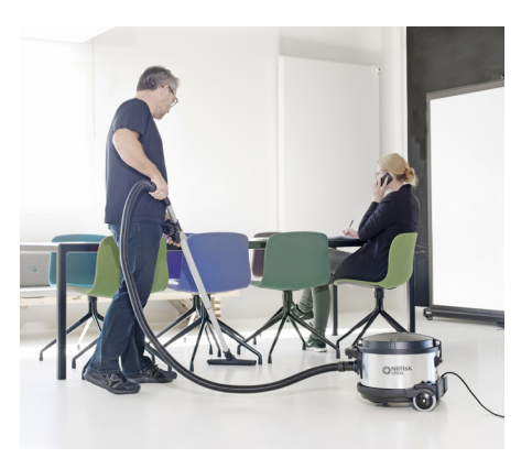
The VP930 is the perfect choice for demanding applications such as offices, hotels and public buildings