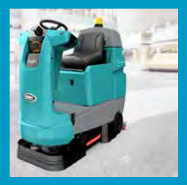
Consistent Cleaning Experience Learn and repeat model ensures consistent cleaning performance while reports help you track key performance indicators across your fleet.