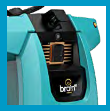
Engineered For Safety Equipped with BrainOS® technology, the autonomous T7 is designed and tested to operate in complex, real world environments while safely avoiding people and obstacles.