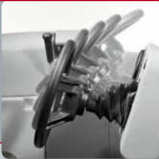
Adjustable steering wheel position provides optimal operator comfort and improved safety.