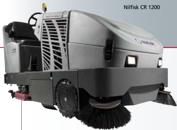
Nilfisk CR 1200

Nothing is left to chance. All models are available as diesel, petrol or LPG with the CR 1200 also having battery variants to meet the specific cleaning applications. The tank capacity is larger than any other comparable machine, providing longer running time, higher productivity and lower cleaning costs. Operator comfort is at an all-time high, thereby reducing fatigue and increasing safety and performance. Maintenance has never been easier thanks to the 'no tools' service access points.