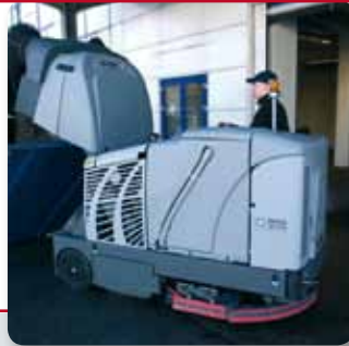
The hopper is easily emptied without restricting the operator's visibility thanks to its smart off-set design