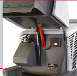
A unique safety block system for the hopper can be activated by the operator from the seating position