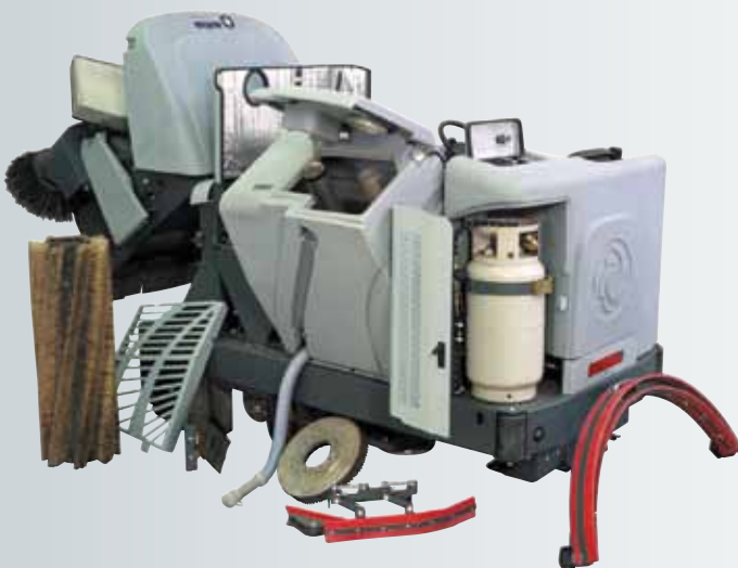
No tools needed in order to access key components. Maintenance is fast and simple